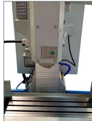
Pneumatic Tool Release Clamp