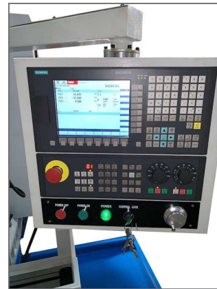
Siemens 808D CNC Controls